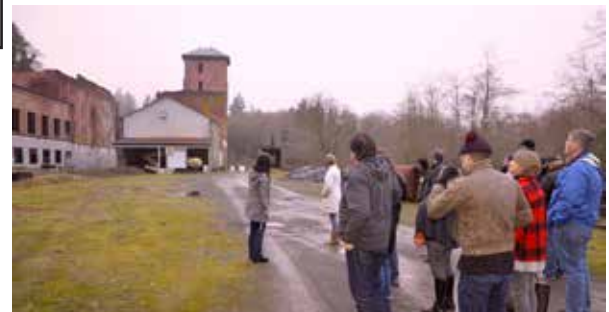
Top left: Over 300 Professionals attended the 2016 CGC, including Processors, Investors and End Users.