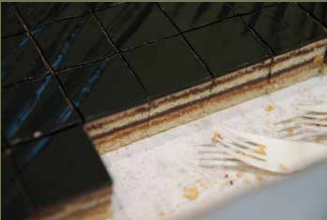
Chocolate Sheet Cake Donated by the Essential Baking Company at the 2016 Cascadia Grains Conference at SPSCC