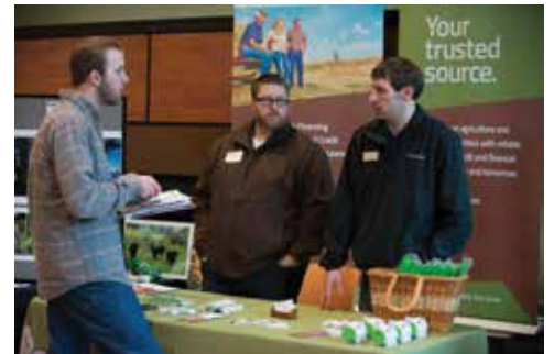
Top Photo: Tasting Tour 2017 Bottom Photo: Resource Tables 2017

Please make all sponsorship checks payable to "Washington State University" with "Cascadia Grains Conference" in the memo and mail to: